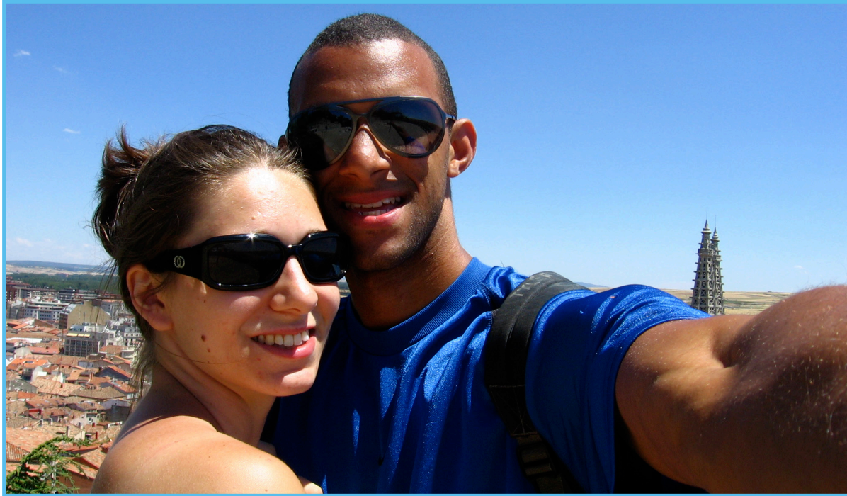
Selfie-time for the happy couple in Burgos, Spain

Change takes time, but it has moved forward for the LGBTQ community. There are GSAs in some of the middle schools in Chapel Hill now. That's something that never would have happened even five years ago. I know! I think it will take longer in other places in North Carolina, obviously. When I went to the School of Science and Math [a public boarding school in Durham], it was really similar. If I hadn't gone there, God knows when I would have come to open acceptance of myself as a queer woman. We had a really active LGBTQ group on campus. What did we call it? (thinks, then brightens) Spectrum! If it hadn't been for that, if I had been stuck in Statesville for those last two years, it just wasn't going to happen. It was moving to a space where literally and metaphorically speaking, that was safe and supportive and it's