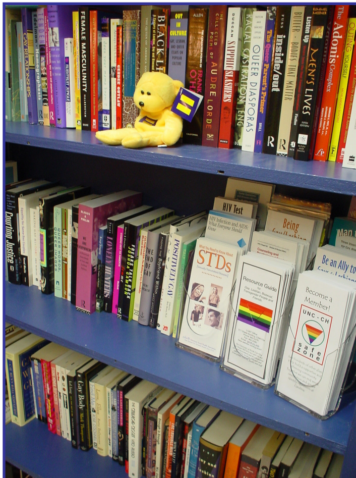
Equality Bear guards shelves at the LGBT Office, circa 2005. This early version of the resource library was a precursor to the current library’s mix of wellness resources, brochures and books.

Ewing’s odyssey had been a circuitous one, but was rooted in a great love for books. Indeed, the library had long been their haven, having been brought up with a great appreciation for reading by parents who would regularly borrow the weekly limit of 40