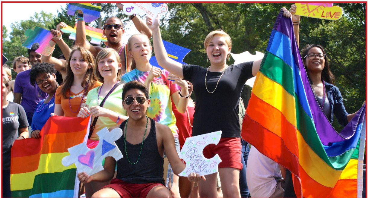
Though Many, We Are One: Students celebrate in the NC Pride parade from atop the UNC float.

// It was exhausting and exhilarating! I can't wait to do it again!