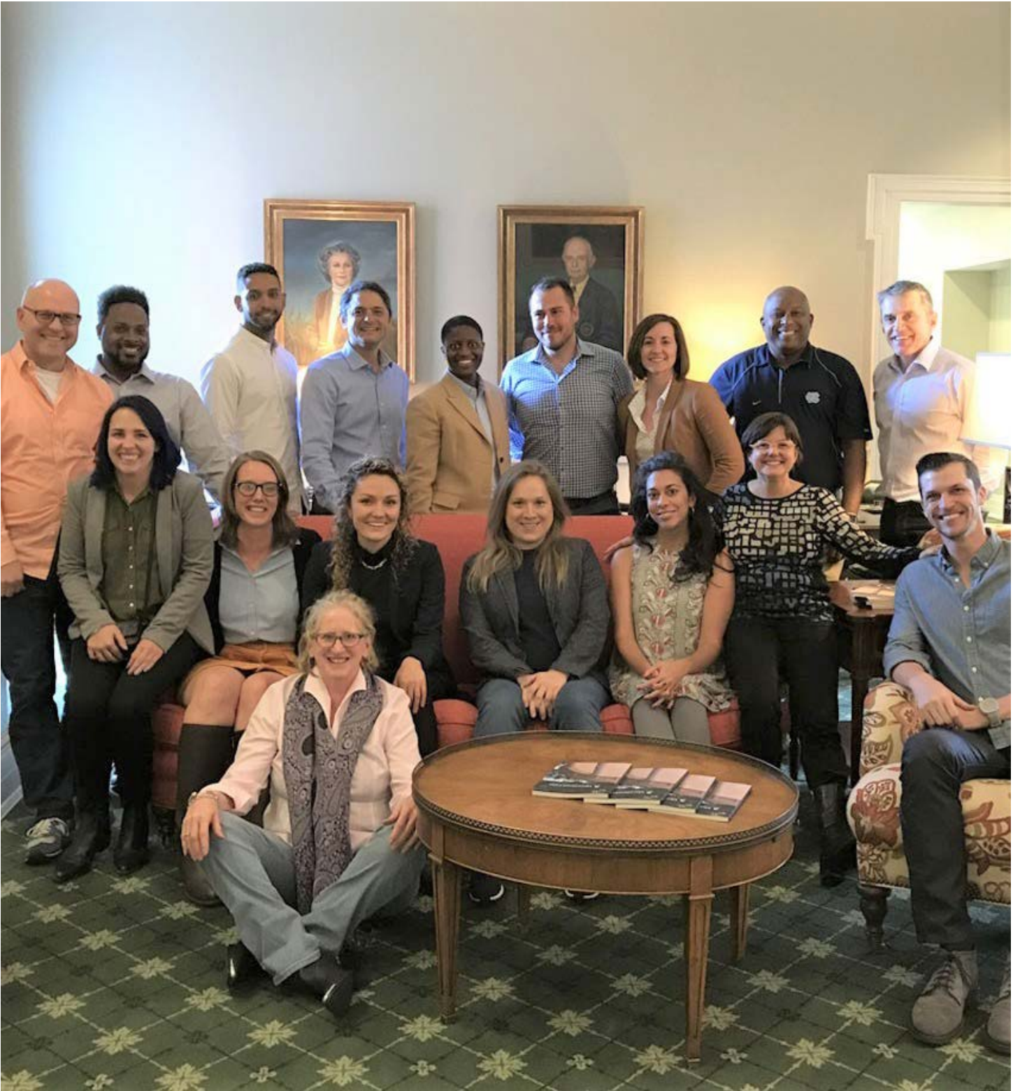
Carolina Pride Alum Network Board of Directors