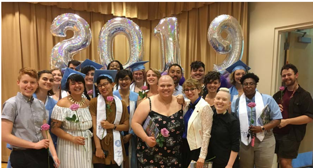
New graduates celebrate with a group photo.

Finally, it was time for the highlight of the ceremony: the recognition of the graduating students. Twenty-one undergraduate students and six graduate and professional students walked in the ceremony. Each student received a lavender